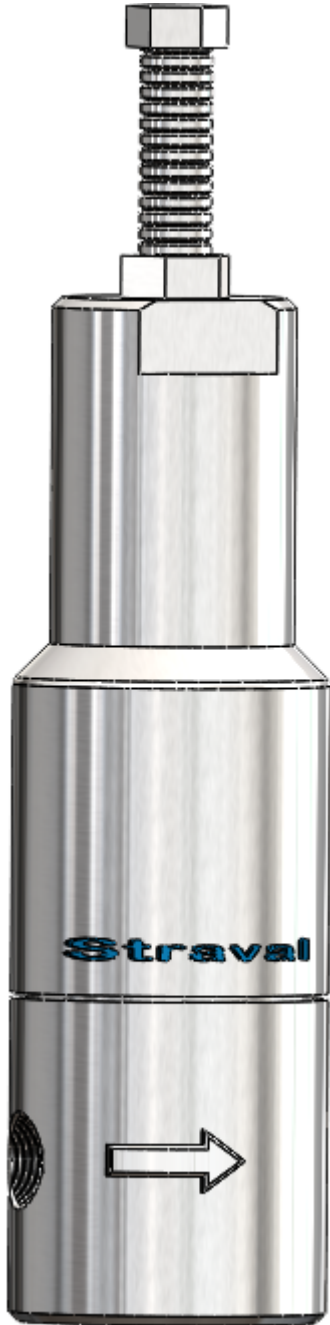
RVC05-Npt angle pattern